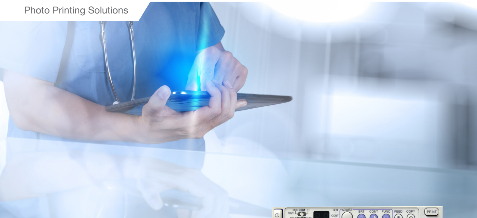
Photo Printing Solutions